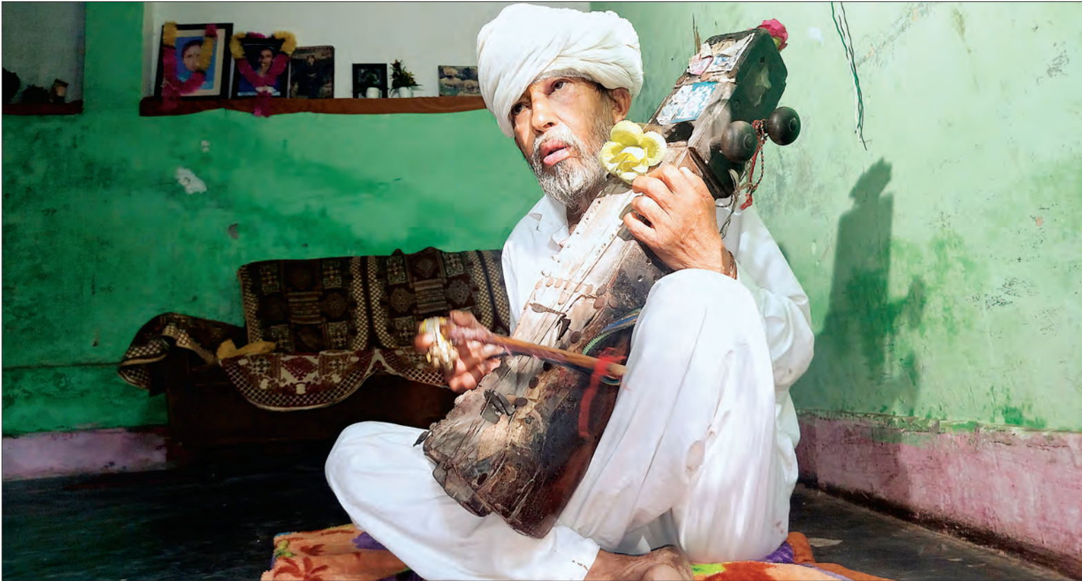
Prime Minister Narendra Modi praises 70-year-old Gori Nath from Udhampur, J&K, for preserving Dogra heritage through his century-old sarangi in his monthly radio programme 'Mann Ki Baat', on Sunday.

"And even under these circumstances based on a large body of evidence from the past 20 years is that such tumors also require treatment with two- and three-drug combinations that simultaneously interdict the primary driving oncogene, block signaling from the primary evolving resistance mechanism and even block signaling from a secondary survival pathway."