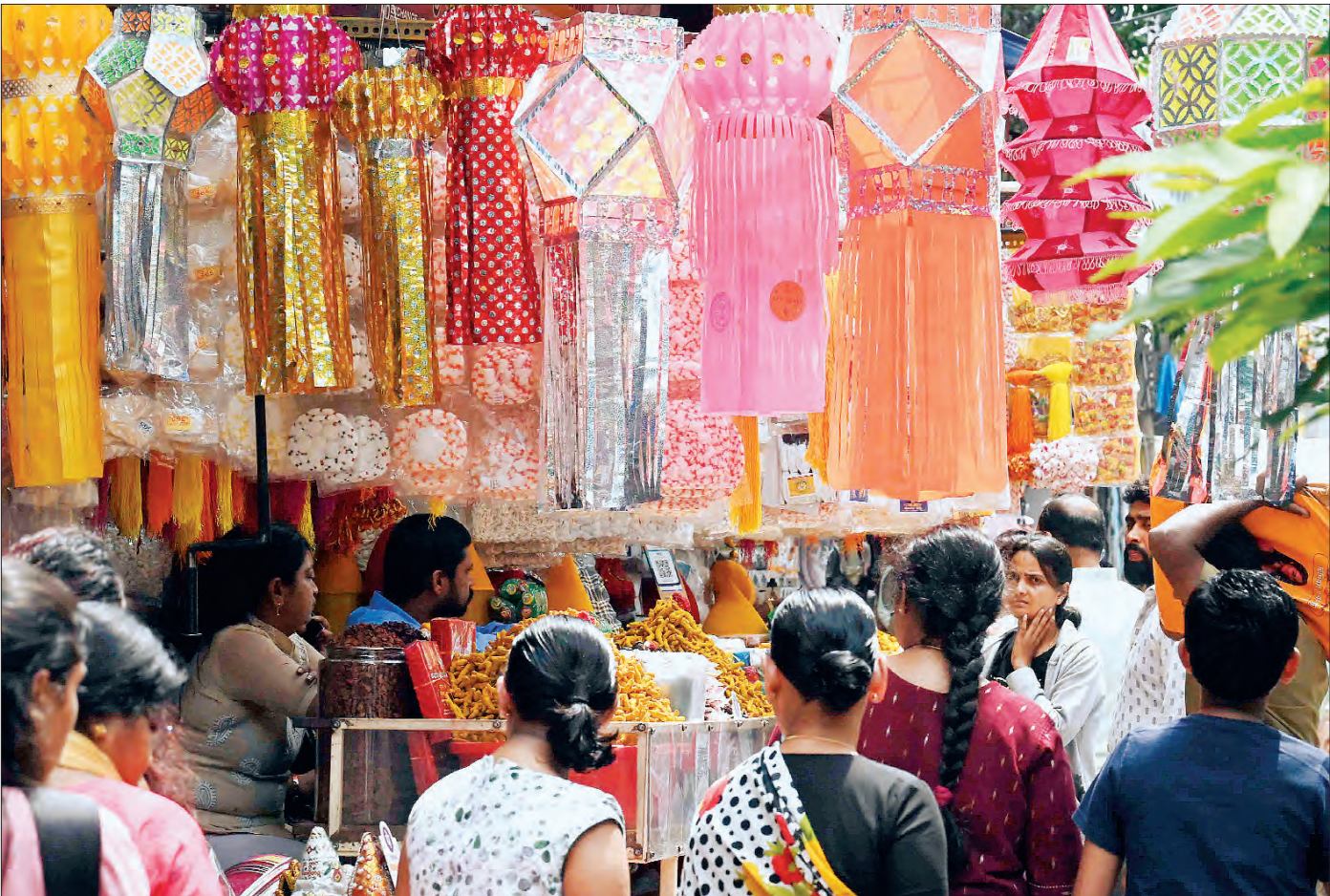
People buy lanterns and decorative items at a market ahead of Diwali festival, at Malleshwaram, in Bengaluru on Sunday.