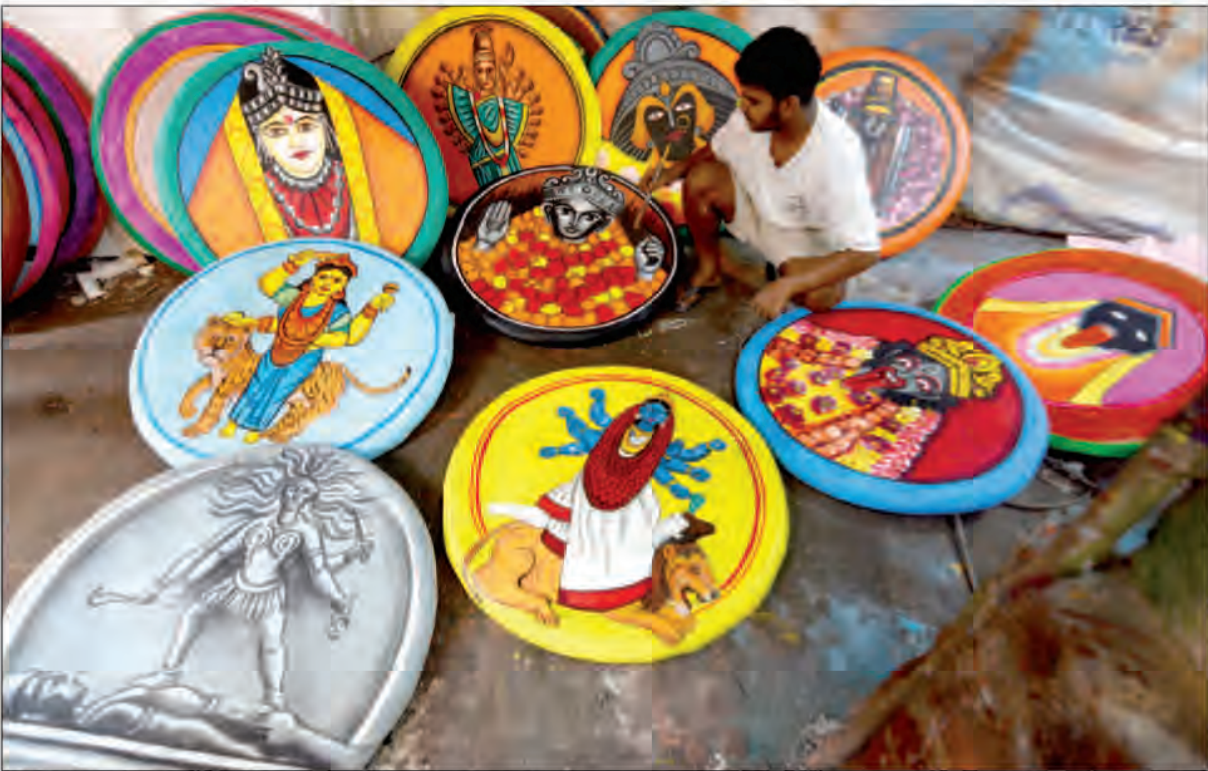
Artist gives finishing touches to an idol of Goddess Kali at the reverse side of the earthenware plate ahead of Kali Puja festival in Kolkata on Sunday.